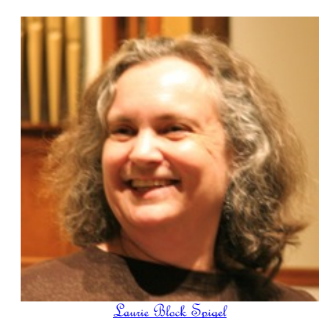
watching her students rehearse their plays